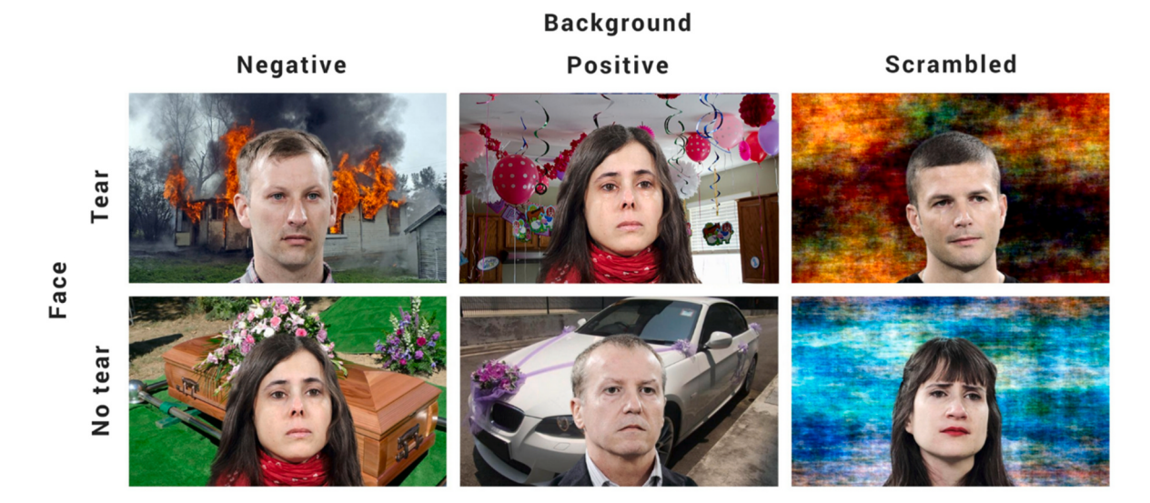
Fig. 1. Examples of stimuli. Compound stimuli consisted of faces with tears or with digitally removed tears and of backgrounds that were either negative, positive, or scrambled. The stimuli included both male and female faces.

The data of three participants consisted of only three functional runs due to technical problems, the rest of the participants completed four runs each.